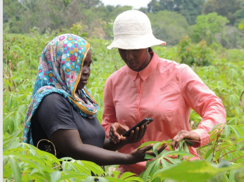
A Tanzanian cassava farmer, left, learns to use a plant disease mobile app developed as part of the PlantVillage initiative led by Penn State researchers.

Key beneficiaries of this investment will include international organisations, like the CGIAR global network of agricultural research centers and FAO, and researchers at local universities and in the private sector. It will help them develop computer vision and machine learning models that can identify, track and predict pest outbreaks. PlantVillage has been a pioneer in the development and deployment of computer vision models that accurately and precisely diagnose crop diseases. This builds upon extensive FAO collaborations, including the eLocust3m mobile app that helped halt the 2020 African Locust plague, and the Fall Armyworm Early Warning system, both built by PlantVillage.