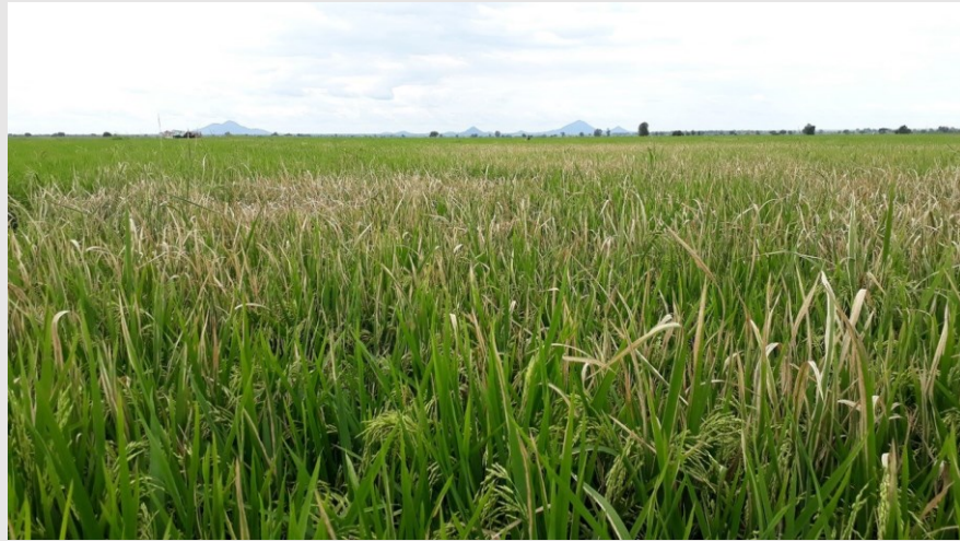
Rice field infected with bacterial blight in Dakawa. The wilting and desiccation of the leaves results in significantly reduced yield for the small-scale food producers.

Bacterial blight of rice, which is caused by the bacterium Xanthomonas oryzae pathovar oryzae (Xoo for short), is responsible for devastating crop losses among rice farmers every year. It above all threatens the livelihoods of small-scale farmers in Asia and Africa, and accounts for malnutrition and famine in the affected regions.