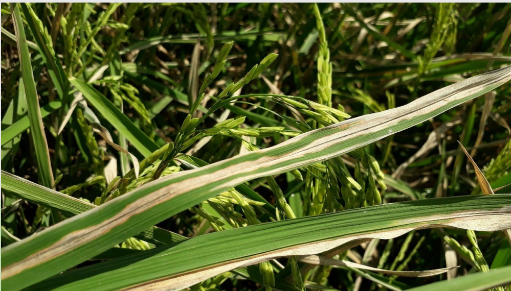
Close-up of a rice leaf infected by Xanthomonas oryzae pv. oryzae . The bacterium migrates through the leaf and causes the typical lesions.

To achieve its goals, the consortium has developed a strategy to combat bacterial blight. The team has already successfully bred disease-resistant rice lines. A diagnostics toolbox has additionally been developed to enable the rapid diagnosis of emerging pathogenic bacterial strains.