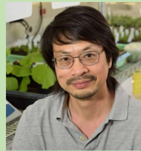
Speaker: Sheng Yang He Duke University, USA Title: Impact of climate on plant-pathogen/microbiome interactions

Plants are impacted by various factors, including other organisms of diverse taxa and environmental factors. These interactions can have a significant effect on plant health and productivity. In recent years, there has been an increasing focus on understanding these complex interactions in order to identify ways to control parasitic interactions and promote mutualistic ones. This session will examine three types of interactions with plants, including biotic interactions, which involve microbes and their vectors, and abiotic interactions, which involve factors such as temperature, moisture, and nutrients. The session will also explore the ways in which plant responses can impact pathogen behavior and the potential consequences of these interactions on plant health.