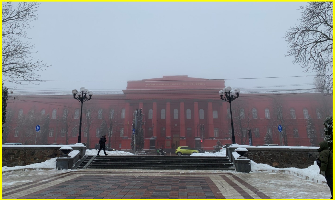
The Red Building, Taras Shevchenko National University of Kyiv.

On 7 February 2023, a severe earthquake struck parts of Türkiye and Syria, and some of the plant pathologists located there lost their lives and or their homes. As this issue goes to press, we are exploring options to support our colleagues in these regions.