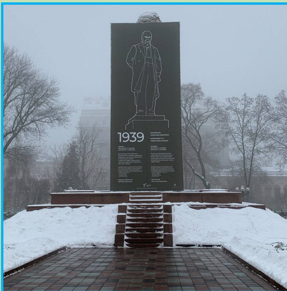
Protected from bombing 2023 - The monument to Taras Shevchenko across from the Taras Shevchenko National University of Kyiv Red Building. Shevchenko was a Ukrainian poet, writer, artist, public and political figure, as well as folklorist and ethnographer.

As we finalise this update it is one year since the 2022 invasion of Ukraine by Russia, and there seems to be no immediate end in sight for the conflict. In the last 9 months ISPP Resilience Bursaries have supported 10 Ukraine scientists who have taken temporary refuge in Poland. During February the ISPP agreed that Bursary funds could also be used to support short term stays by Ukraine scientists in Poland and other places, to enable exchanges without jeopardising the continuity of their teaching and research responsibilities in Ukraine Institutions. Ongoing support for the ISPP Resilience Bursary will be critical to enable an adequate response Please consider donating ( donate here ). Enquiries can be directed to resilience@isppweb.org .