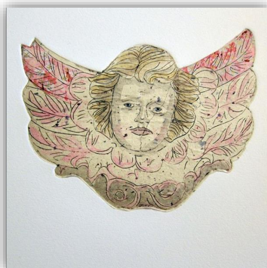
Daniel's angels – Collagraph with chine collé and watercolour (D. Hüberli, 2015)